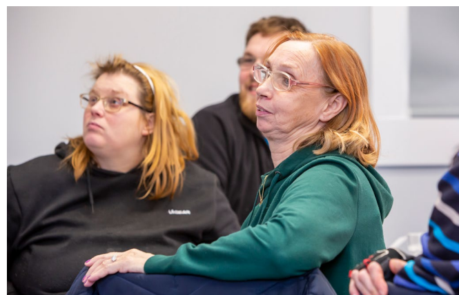
Right Ark's community working together to set the new vision and mission.

We provide care and support to one of the most marginalised and vulnerable groups of people in society and our vision is that through our work and the work of others, this group will be enabled to become active citizens in the communities in which they live.