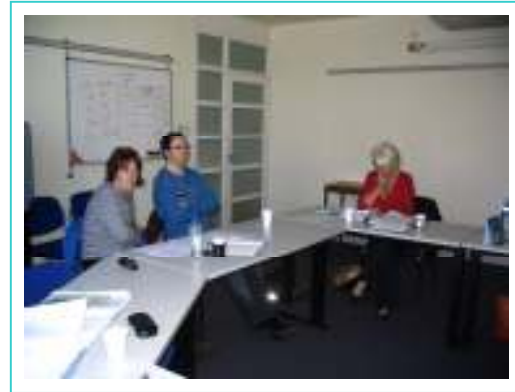
The conference organising team.

The people who went filled in an evaluation form. Here's what some people said: